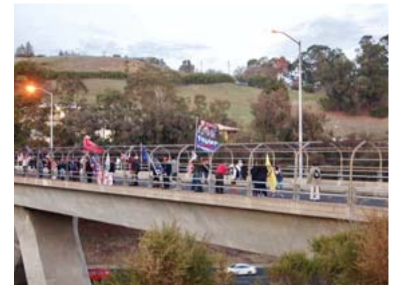
Protestors on the El Curtola Pass on Feb. 10.